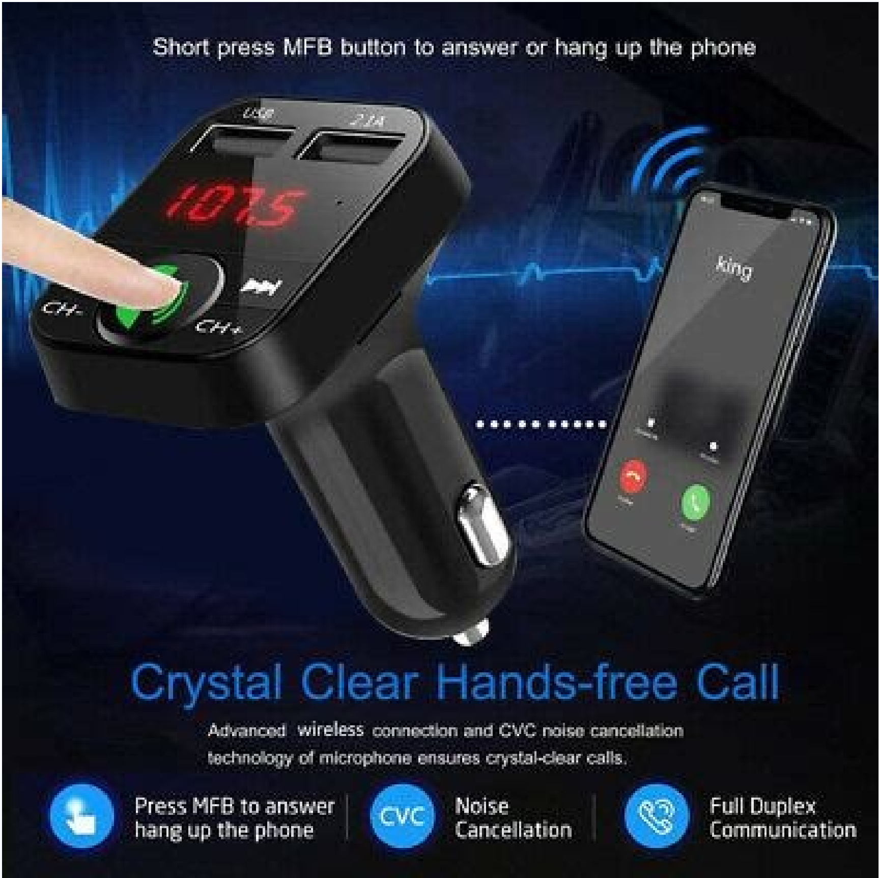
Fm transmitter radio for car apk. Android car fm radio apk. Car fm radio price. Car radio explained. How to get capital fm on car radio.